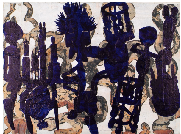
Bo Joseph, Untitled , 2005, ink, acrylic, tempera, charcoal and collage on canvas, 22 5/8 x 30 1/8 inches (57.5 x 76.5 cm)