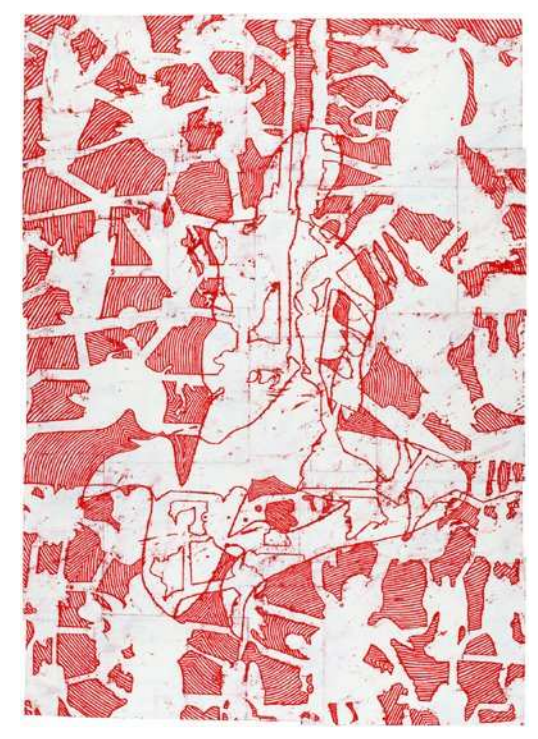
Bo Joseph, Where Fear and Fantasy Converge, 2011; Oil pastel, acrylic and tempera on joined paper; 79 3/8 x 56 1/2 in

Taking place at the Event Deck at L.A. LIVE - a 100,000 square foot, rooftop venue - PULSE Los Angeles is modeled on its flagship Miami fair, offering a comfortably scaled and dynamic event indoors and out. The fair's signature series of original programming will make its return with an ambitious slate of sculptures, murals, performances and multimedia works, with this edition placing a strong emphasis on the contemporary art and culture of Los Angeles.