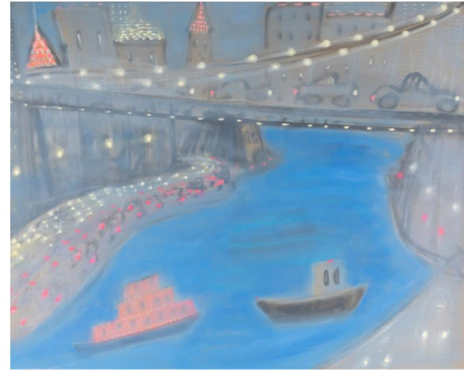
Image: City in Fog oil on canvas 53 x 48 inches